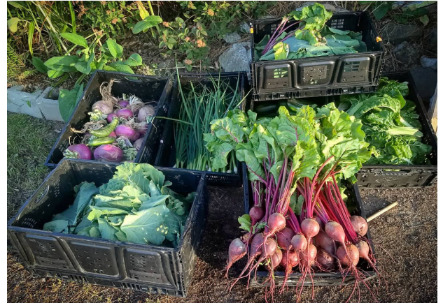
Ballard P-Patch ▲