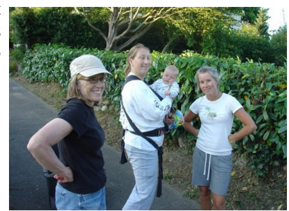
Kirke Park workers break for a rest

design the space to reflect our community and its needs. Now, with all the planning and dreaming coming to fruition, we can look forward to tending and enjoying a beautiful neighborhood park with new friends.