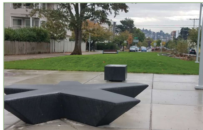
GEMENSKAP PARK

Reach out to us at: eastballard@gmail.com , www.eastballard.org , www.facebook.com/eastballard/ , #eastballard and #gemenskappark .