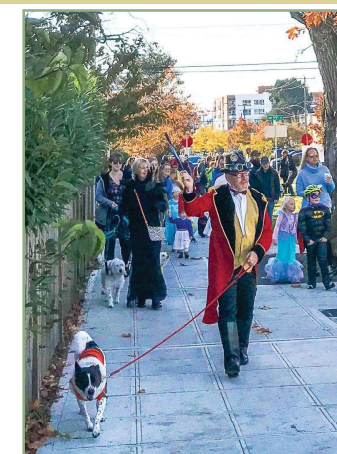
GEMENSKAP PARK