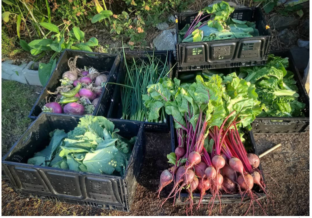
Ballard P-Patch